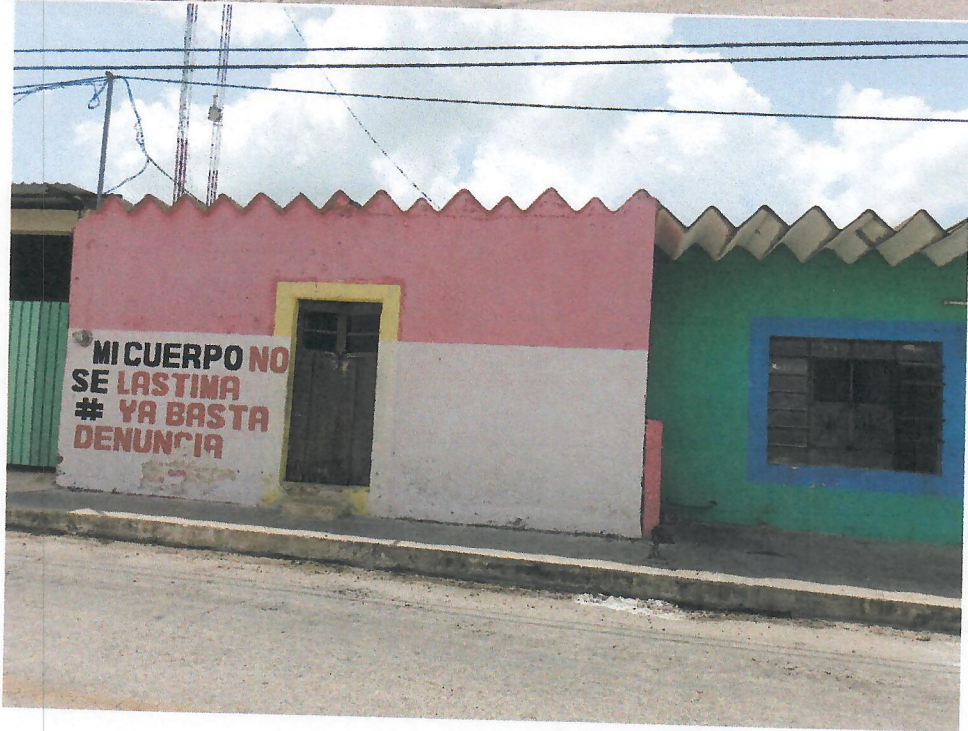
Calle 19 x 20 y 22 Cansahcab, Yucatán