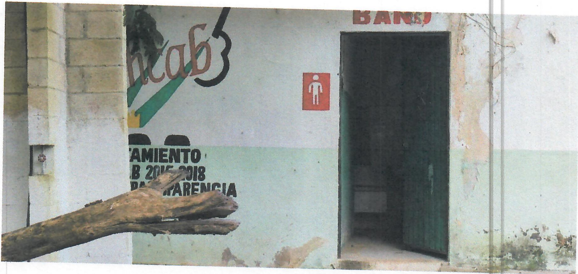
Baños de la comisaria de Santa María.