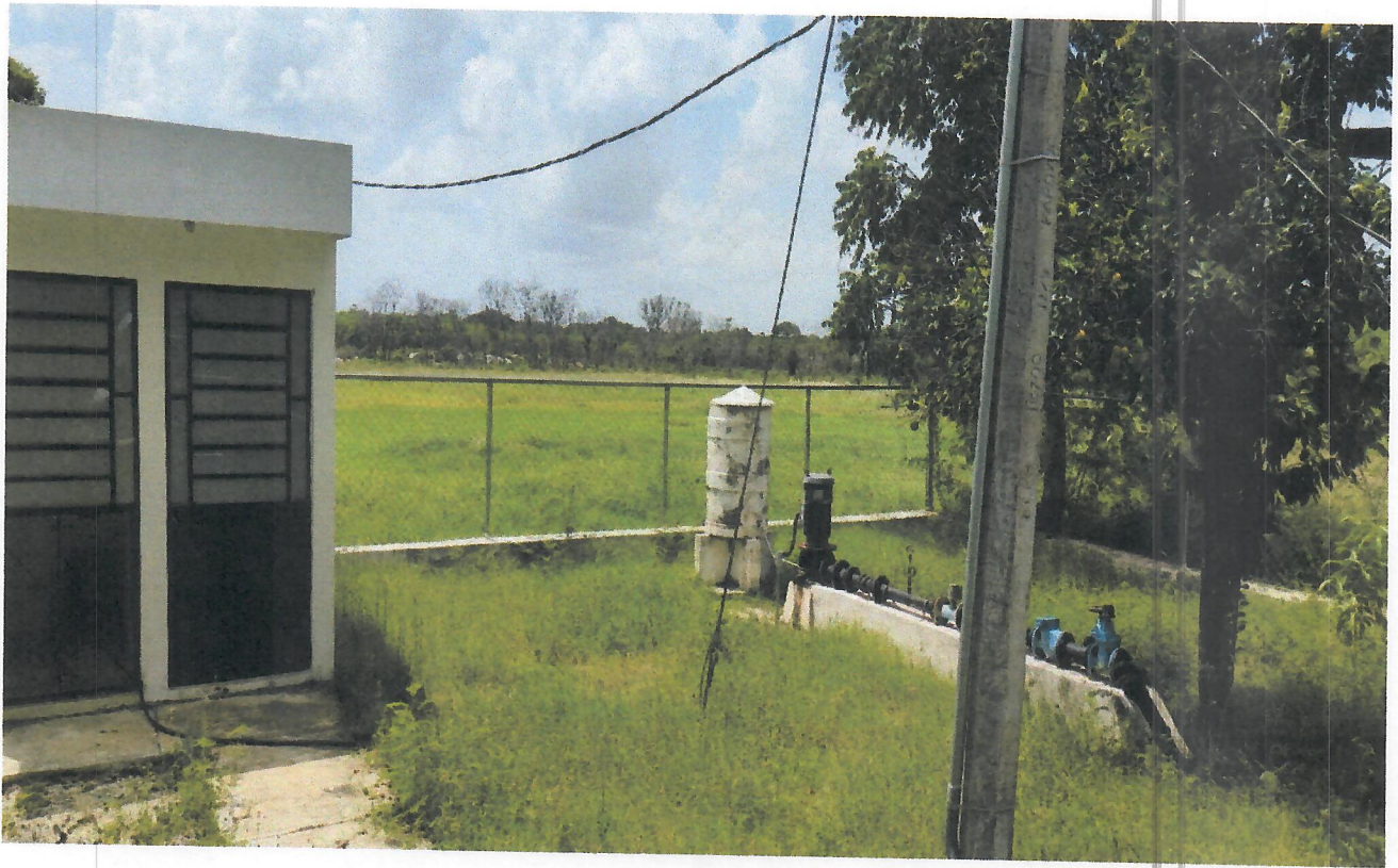
Bomba de agua potable, comisaria de Santamaria