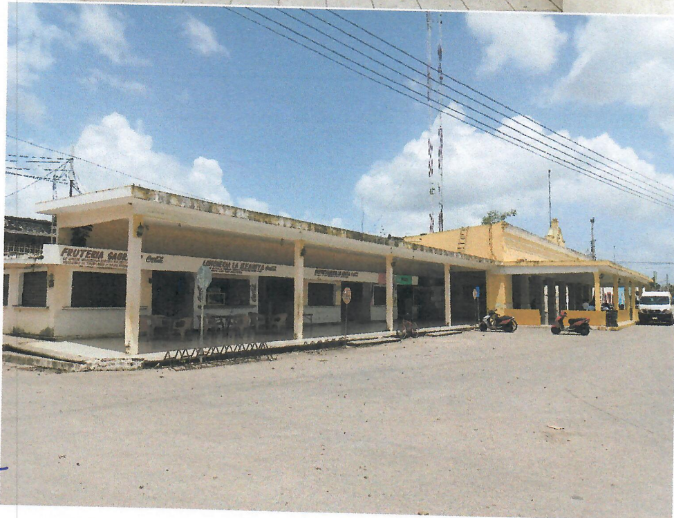
Palacio y Mercado Municipal c. 19 s/n x 20 y 22 Cansohcab