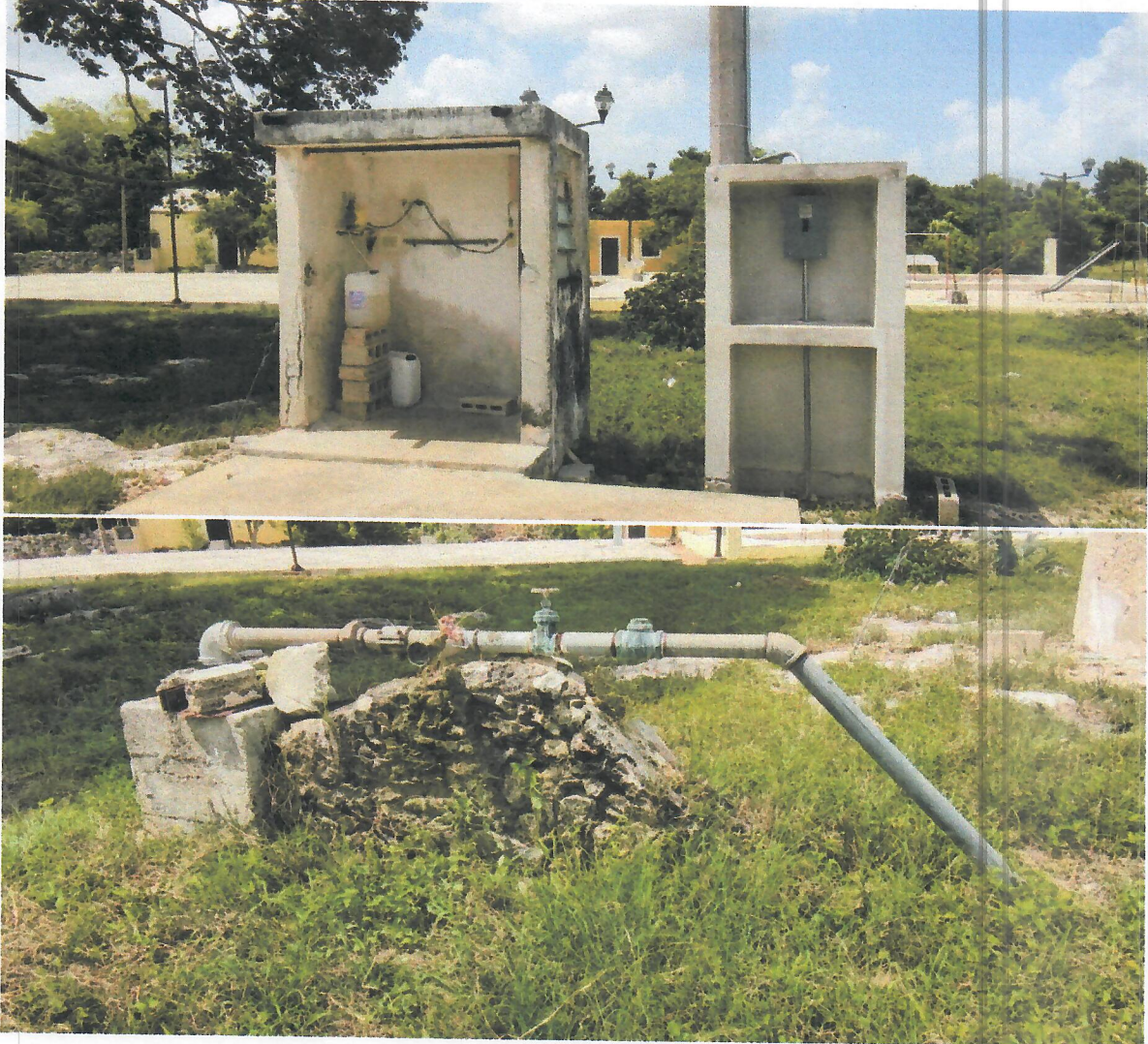
Bomba de agua potable de la comisaria de Xiat.